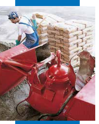
Mixing Topcem with an automatic pumping unit