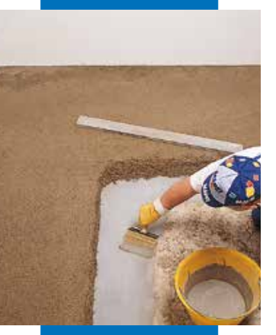
Spreading the anchoring slurry for bonded Topcem screeds