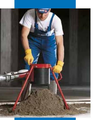
Batching a Topcem mix

will compact to produce a closed and smooth surface without water bleed.