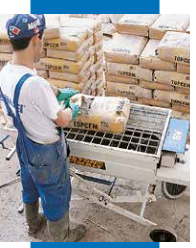
Mixing Topcem in a mini-batcher